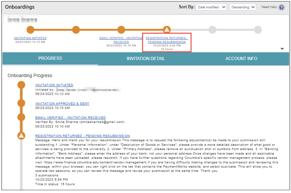
The Invitation Detail screen with a message sent by Vendor Management to the vendor.